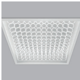
LGO-MP (Micro-Prismatic diffuser) Micro-prismatic diffuser creates variable effects according to your point of view

This is a fixture model with a wide usage and application. The light coming from multiple LED sources in LGO fixtures passes through the opal diffuser and provides an extremely soft and homogeneous distribution to the environment. Production for all types of suspended ceilings is possible. Therefore, production is made according to the brand/model of the suspended ceiling to be used. This fixture, like all Litpa fixtures is highly efficient and economical.