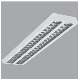
LSS 30-120/2 Double parabolic reflector (optional)